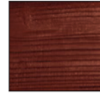
Semi-Glossy Mahogany Wood

Integrated Speakers in Fabric Cross-Beam Profiles