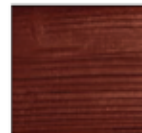
Semi-Glossy Mahogany Wood