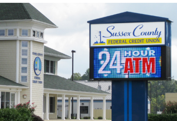
Ignite makes it easy to design eye-catching advertising.

Tap into our expert tech support 24/7 by visiting our service KnowledgeBase at watchfiresigns.com/kb . Search the KnowledgeBase for answers to technical questions, or use the email or live chat tabs to get quick, expert answers from the Watchfire Technical Support team. Our Danville, IL-based support is also available by phone answer your questions. When you need us, we're here to help.