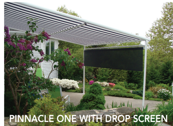
PINNACLE ONE WITH DROP SCREEN