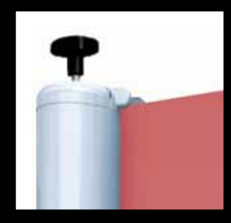
Manual Tension Setting